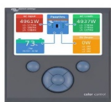
Color Control GX