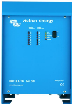
Skylla TG 24 50